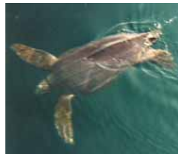
Leatherback Turtle

For more information, visit NatureNB at www.naturenb.ca